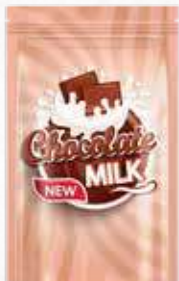
Chocolates & Candies