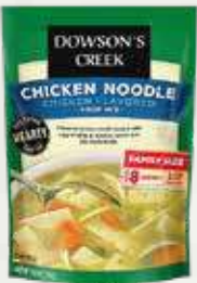
Dry Soup Powder