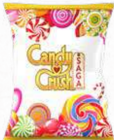
Chocolates & Candies