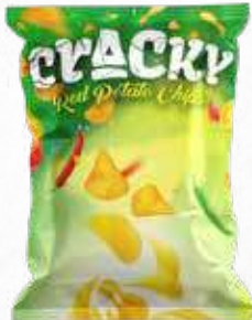
Chips & Snacks