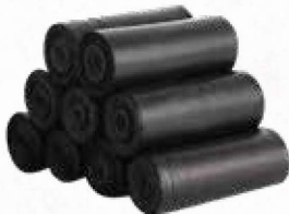
Garbage Bag Roll