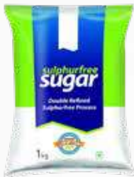
Lentils, Sugar & Salt