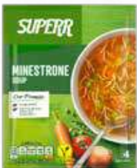
Dry Soup Powder