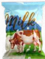
Skimmed Milk Powder