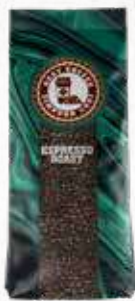
Roasted & Ground Coffee