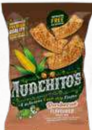
Chips & Snacks