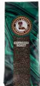
Roasted & Ground Coffee