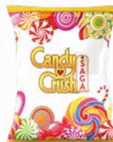
Chocolates & Candies