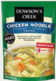
Dry Soup Powder