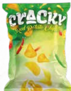
Chips & Snacks