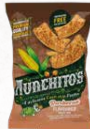
Chips & Snacks