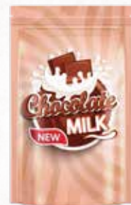
Chocolates & Candies