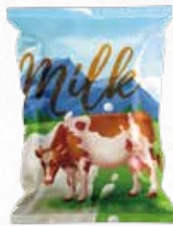
Skimmed Milk Powder