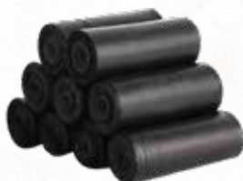
Garbage Bag Roll