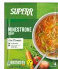
Dry Soup Powder